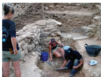
UNC students excavating the Late Geometric-Early Orientalizing building.

world. Countering this trend in the literature, the central argument of the Azoria Project has been that the economic growth apparent in the later part of the Early Iron Age and the early Archaic period culminates in a period of urbanization at the end of the 7th century, which is a phase of