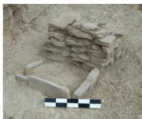
Altar and hearth in the Archaic shrine of the Monumental Civic Building.