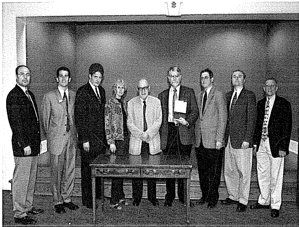
Eight of the contributors to Augusto augurio gathered in Chapel Hill for the presentation of the volume.